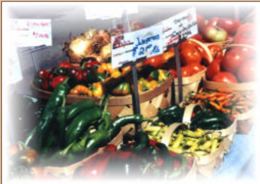
It's chile time again!